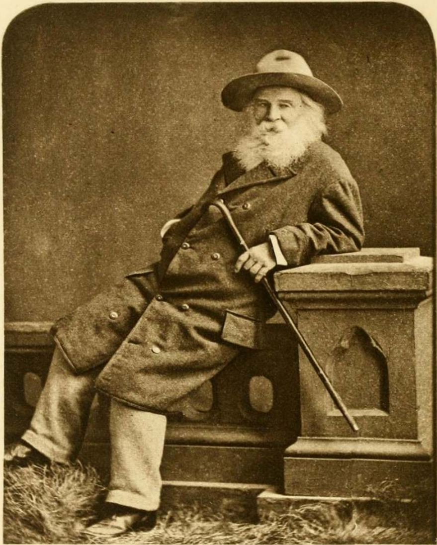
Walt Whitman London Sept 22 1880