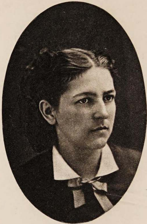
Mrs. Robert Louis Stevenson At the Age of 30.