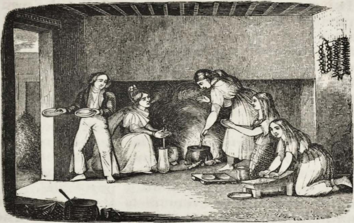
A KITCHEN SCENE.

comal ( comalli , by the Indians), and placed over the fire, where, in less than three minutes, it is baked and ready for use. The thinness of the tortilla is always a great test of skill in the maker, and much rivalry ensues in the art of preparation. The office of making tortillas has, from the earliest times, pertained chiefly to the women, who appear to be better adapted to this employ than the other sex, both as regards skill and dexterity, in preparing this particular food for the table. I perfectly agree with the historian Clavigero, however, in the opinion that "although this species of corn-bread may be very wholesome and substantial, and well-flavored when newly made, it is unpleasant when cold."