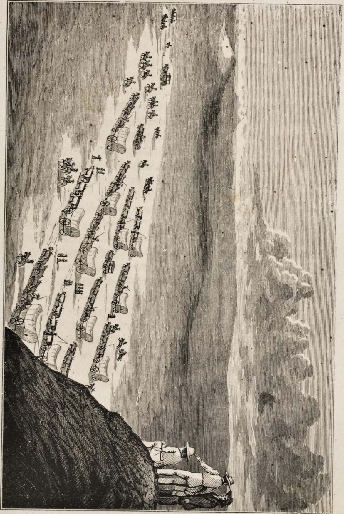
MARCH OF THE CARAVAN