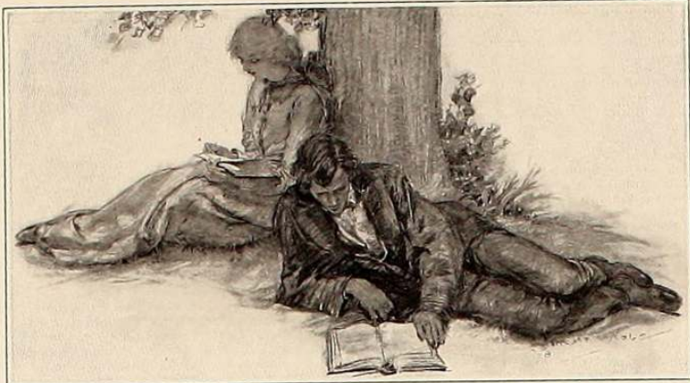
"Often the Two Were Seen Under a Sycamore on the Hill Studying Together"