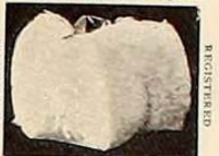
Maish Laminated Cotton Down

Send for a sample of this wonderful filling. Compress it. Then watch it expand.