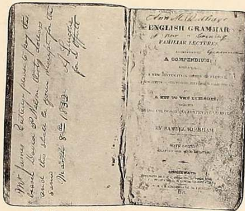
The Grammar Which Lincoln Studied as a Young Man