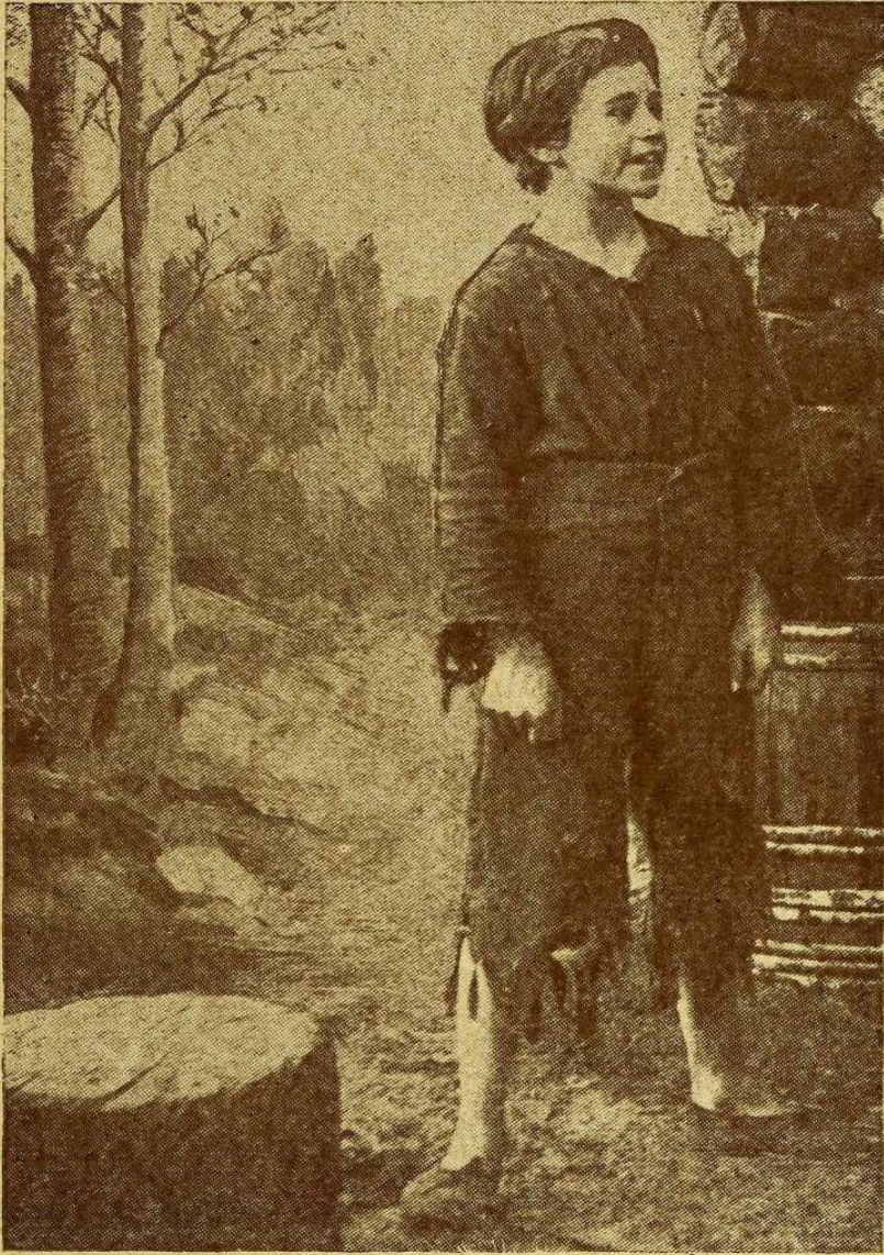
The Rich Little Poor Boy.