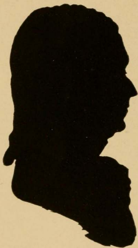
GEN. PELEG WADSWORTH.