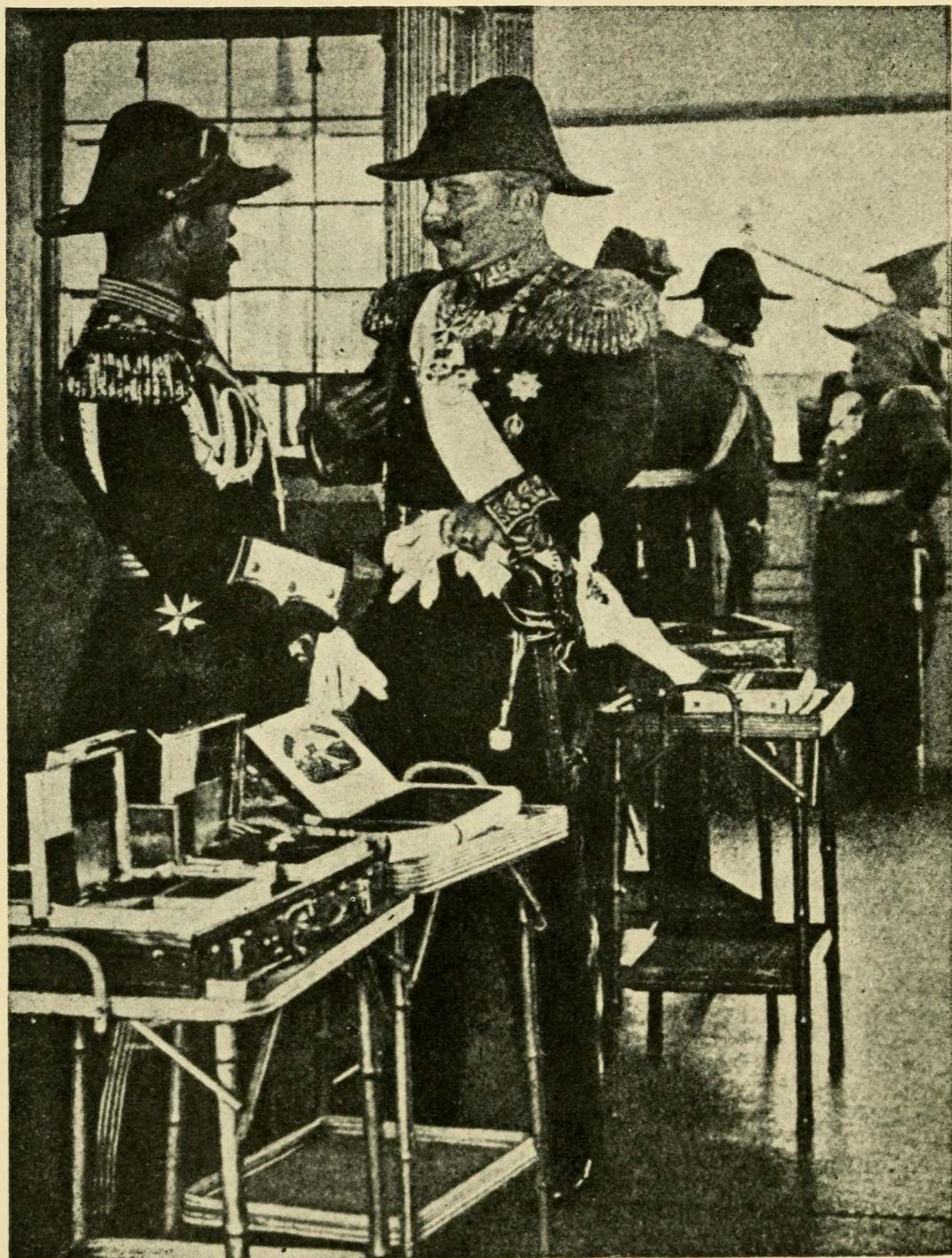
Meeting of the Kaiser and the Tsar at Bjorkö