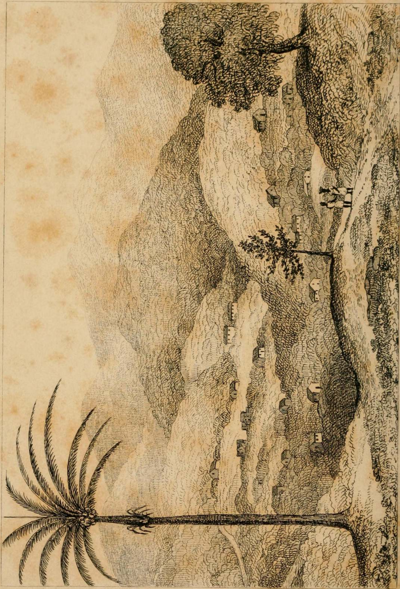
SLIGOVILLE - JAMAICA.