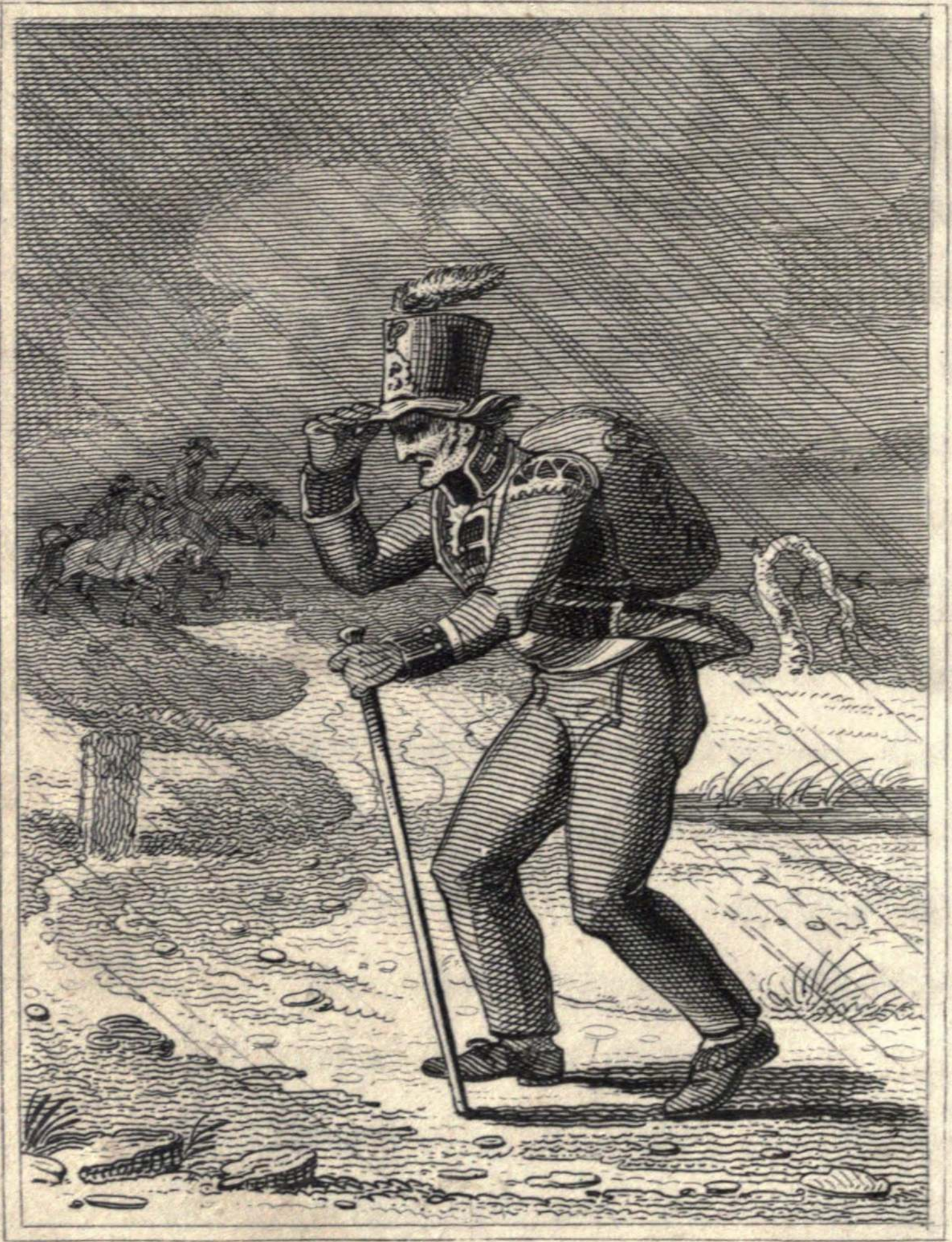
The Old Soldier.