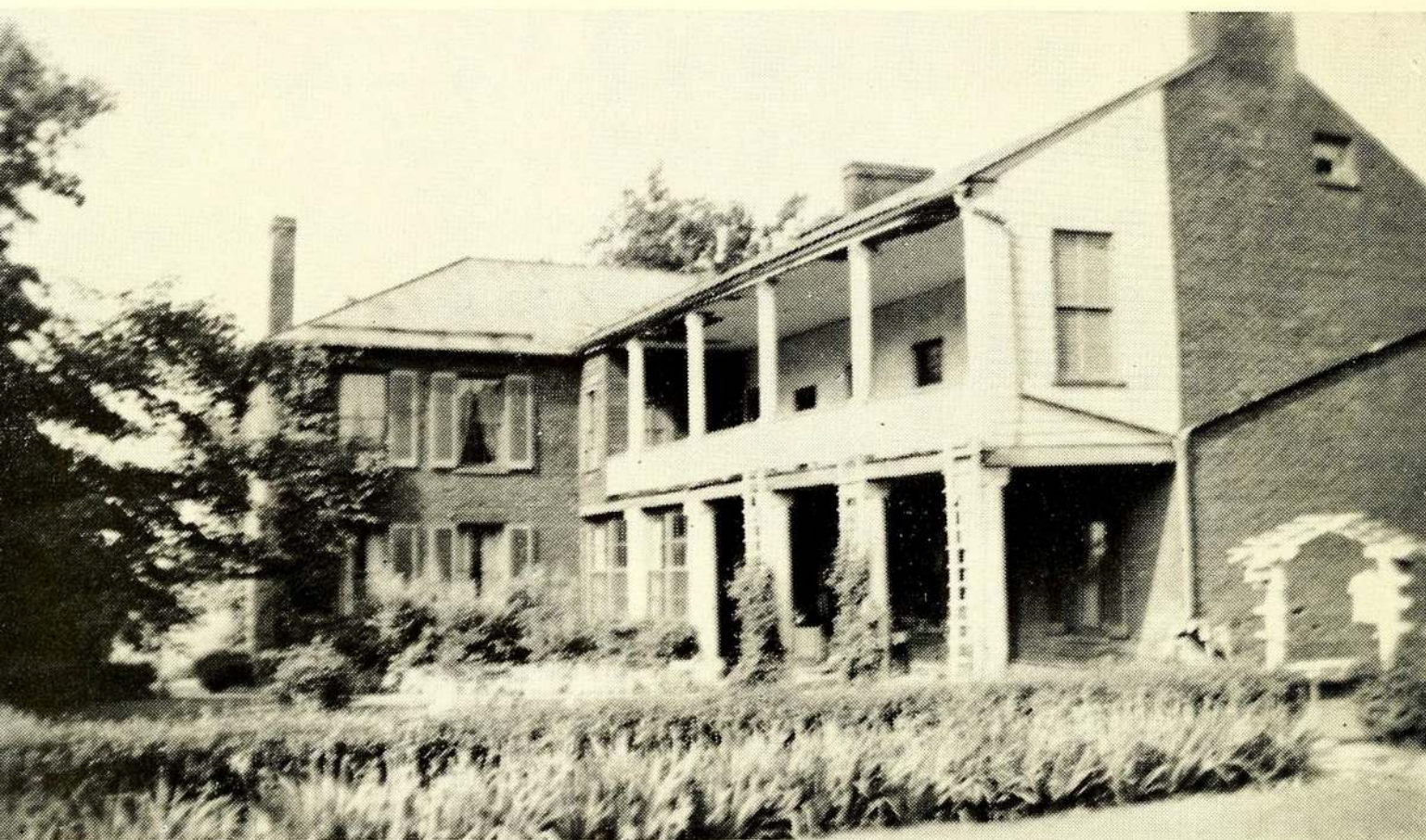
FERRY HILL PLACE AS OF 1940