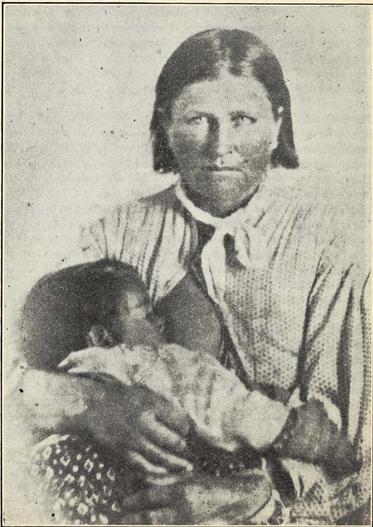
Picture of Cynthia Ann Parker, with her babe nursing, Prairie Flower, taken a few days after her capture by Sull Ross, mother of Quanna Parker, Comanche Indian Chief.