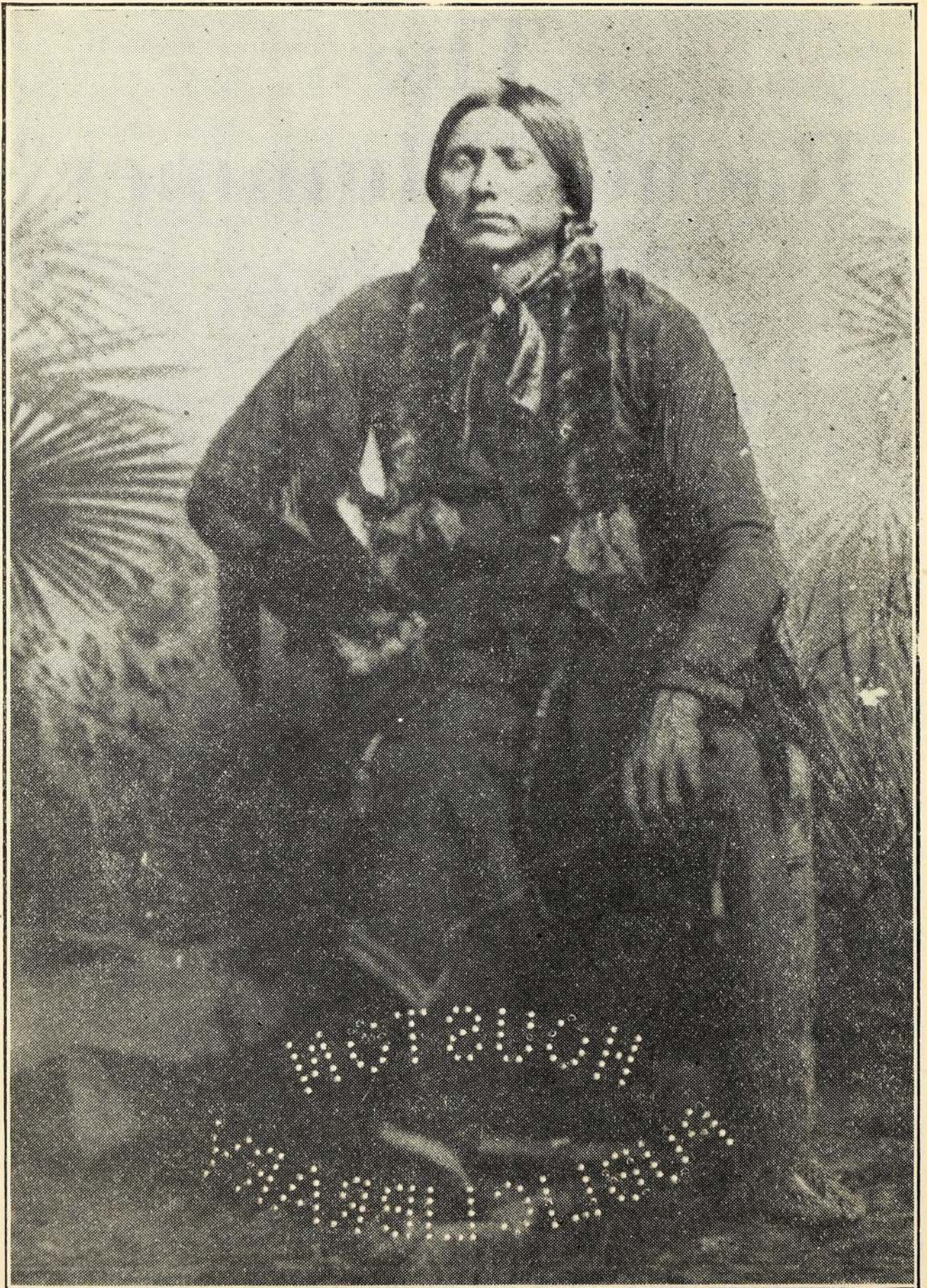
Picture of Quanna Parker, Chief of Comanche Indians, now deceased.