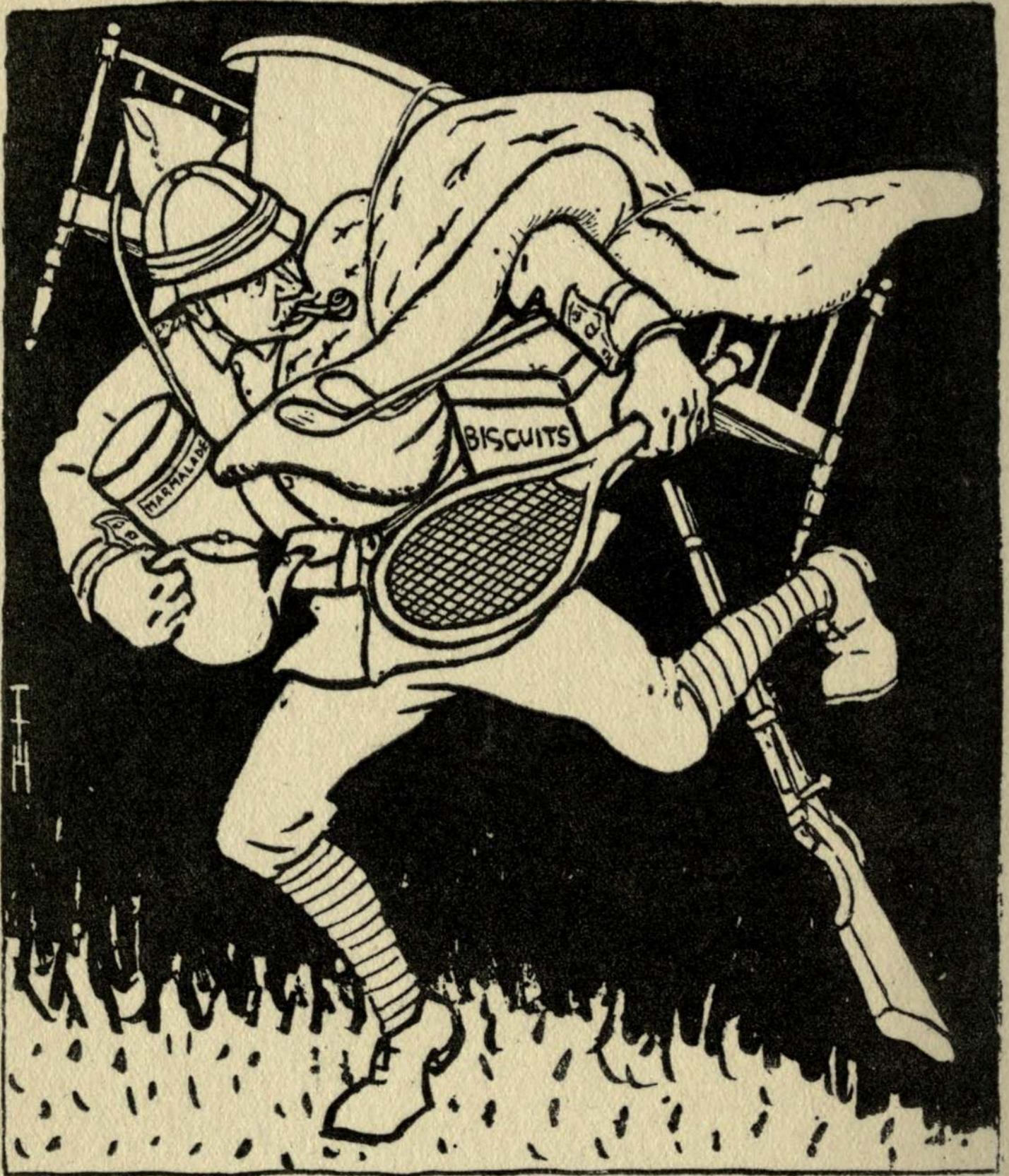
ENGLISCHE KRIEGSFÜHRUNG (How the Englishman makes war.)