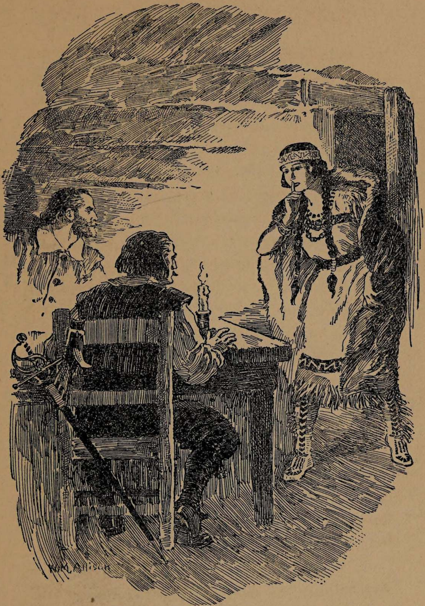
Three times Pocahontas stole cautiously into Jamestown and warned her new friends of threatened attacks.