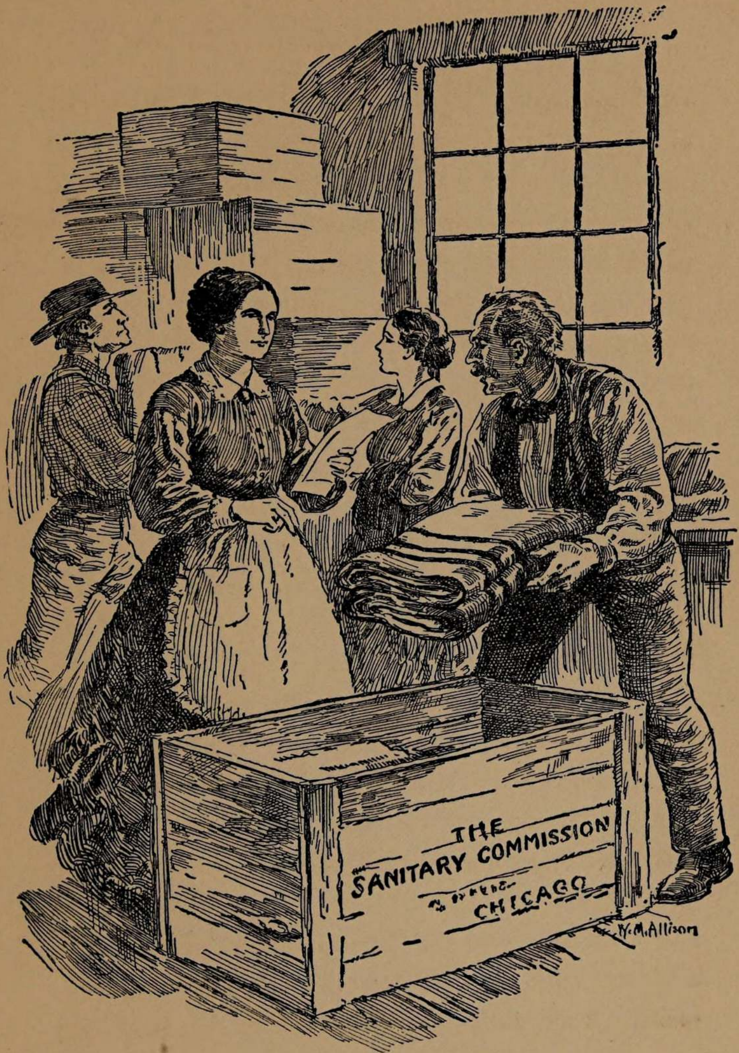
Mary A. Livermore had enlisted not for three months, but for the duration of the war.