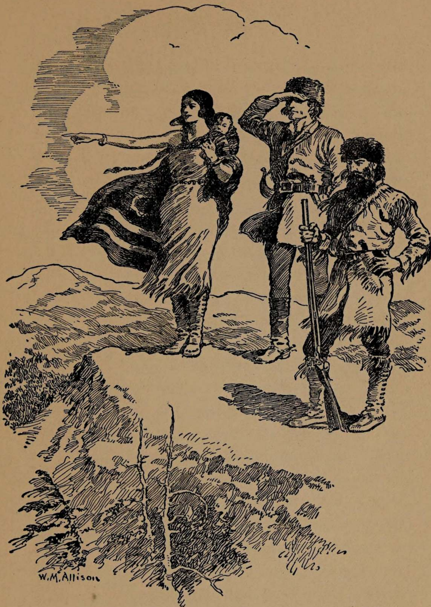
There was more than one hero of this journey to the Far West, but only one heroine—Sacajawea.