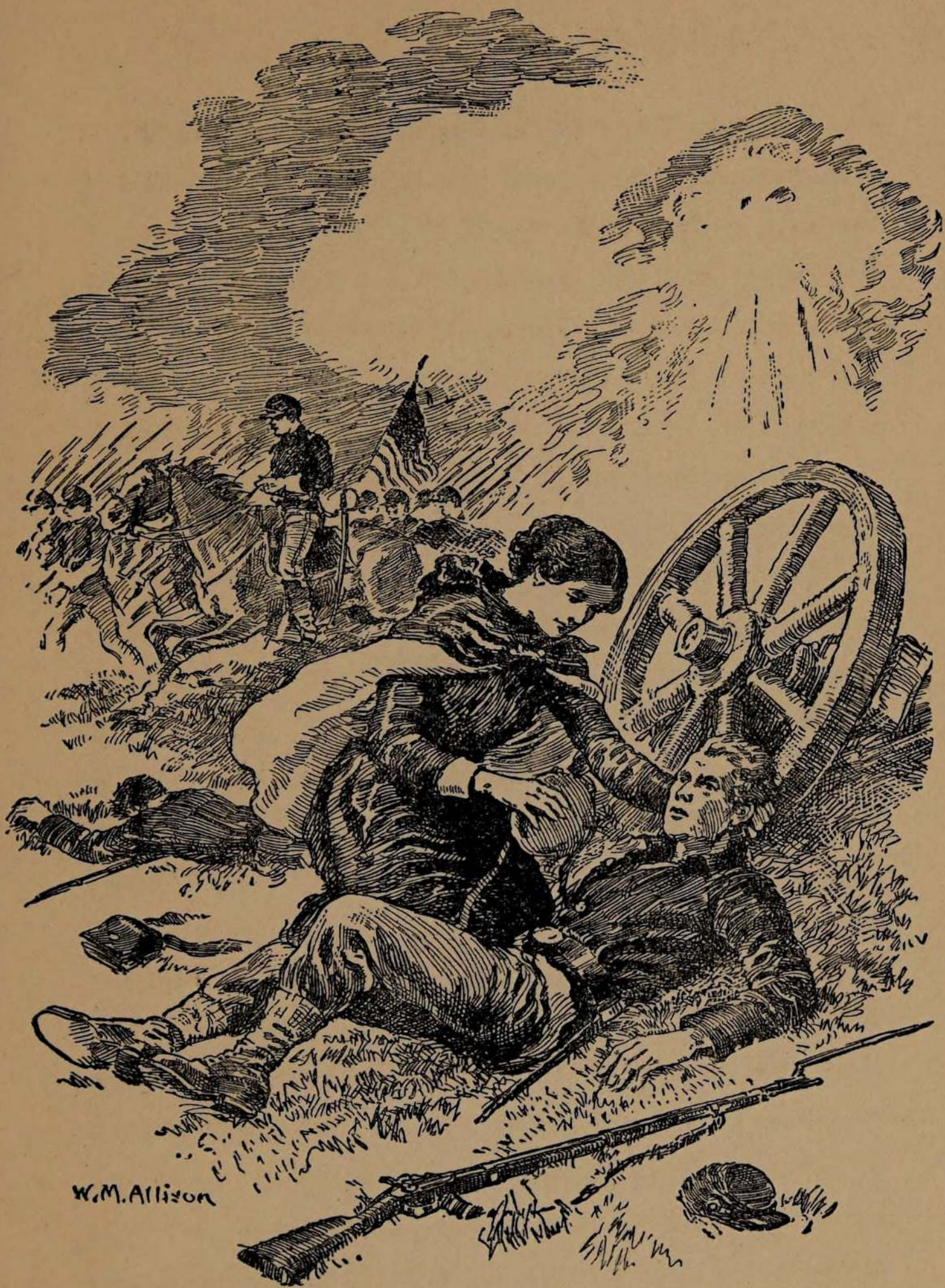
Through the weary years of the war Clara Barton stayed at her post.